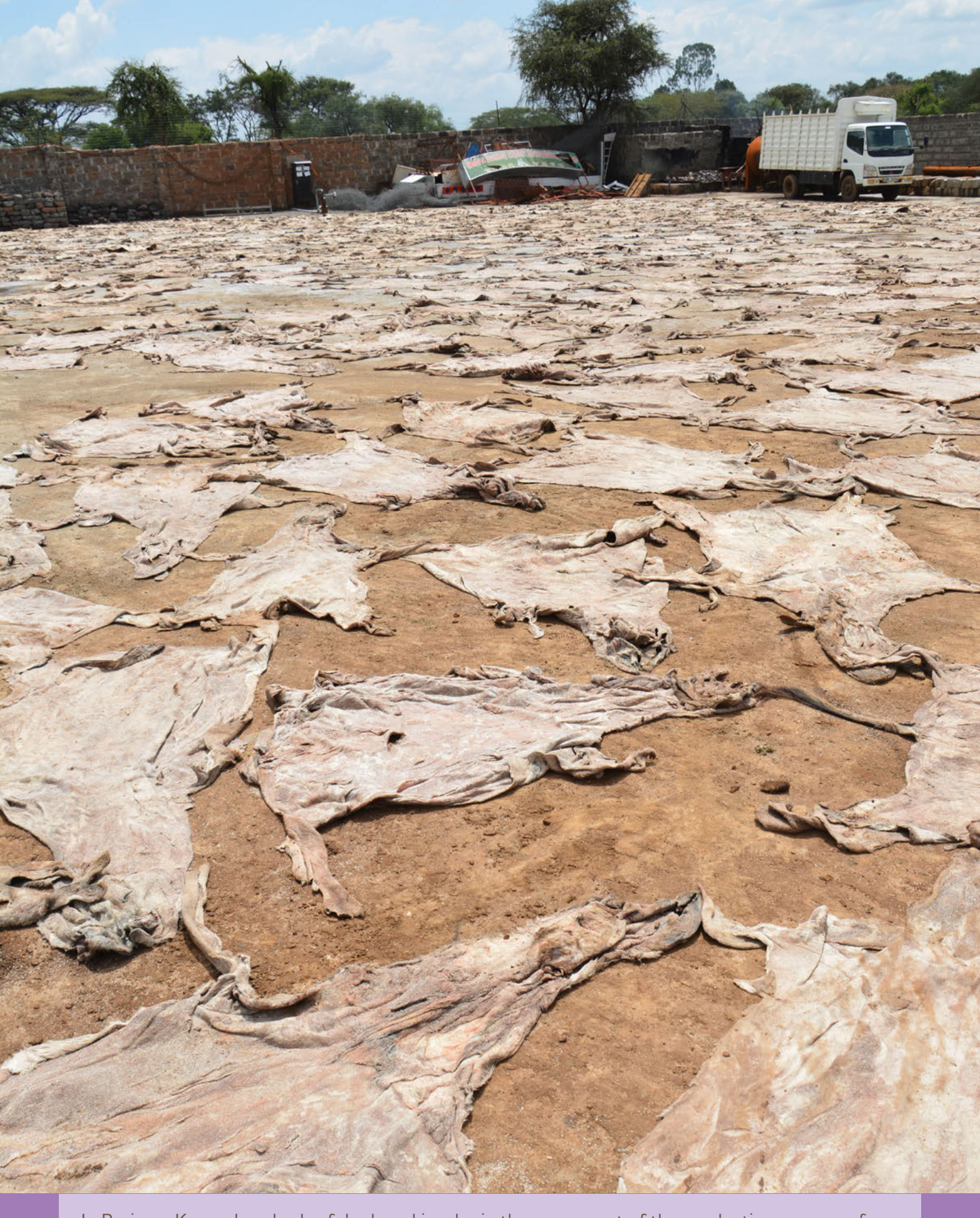
In Baringo, Kenya, hundreds of donkey skins dry in the sun as part of the production process of ejiao. Large-scale donkey slaughterhouses are known to have been established in Kenya and other areas of Africa, with the continent's huge donkey population a key target for the skin trade.