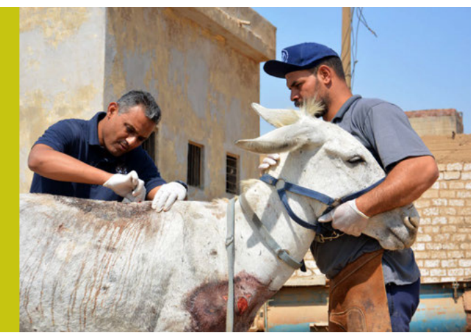
EGYPT — case study

Through the Ghana Society for the Protection and Care of animals, we funded a scoping project to unearth the impact that the donkey skin trade is having on population numbers in Ghana. The findings are informing our wider project to tackle the biggest welfare issue facing donkeys today.