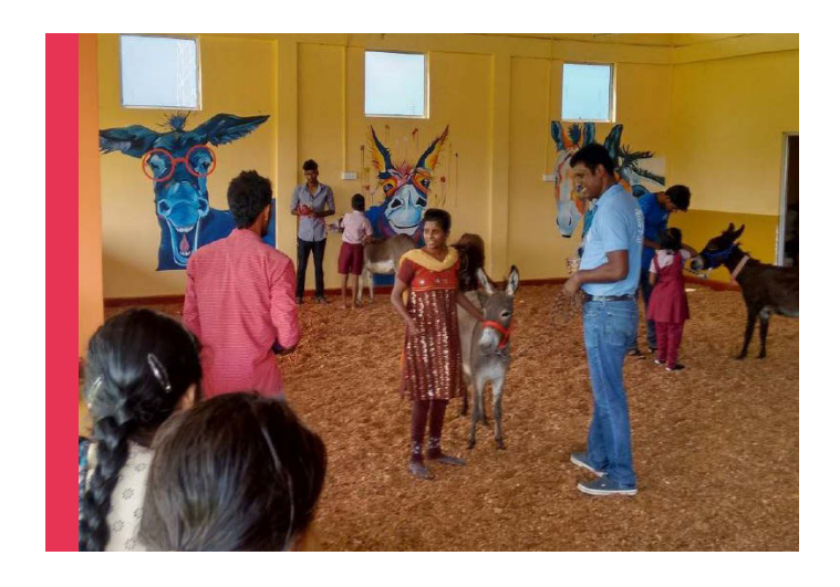
SRI LANKA — case study

In 2017, we increased the number of countries in which we work and support collaborative projects from 27 to 38.