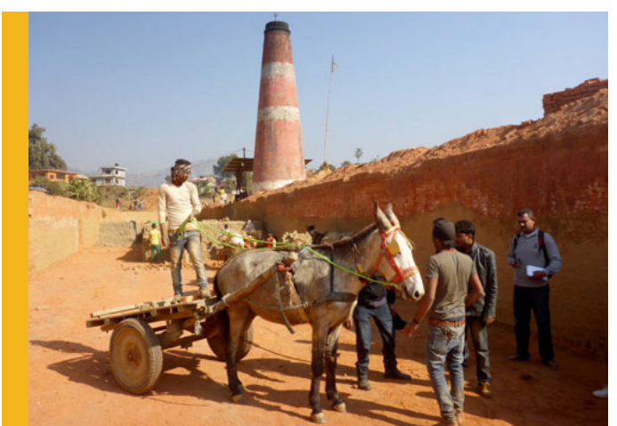
NEPAL — case study

We saw the positive effects of previous harness workshops in Africa, such as one in Tanzania which helped a harness maker called Aaron return to Zimbabwe armed with the knowledge and skills to train others, enabling sustainable improvements for donkey welfare.