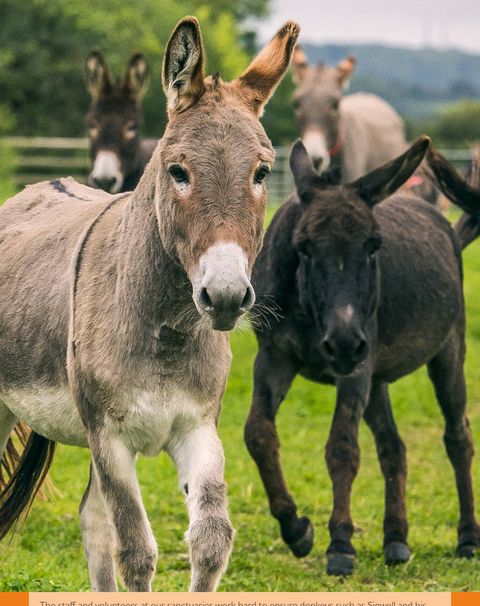
The staff and volunteers at our sanctuaries work hard to ensure donkeys such as Sigwell and his friends receive the best care for health and wellbeing.