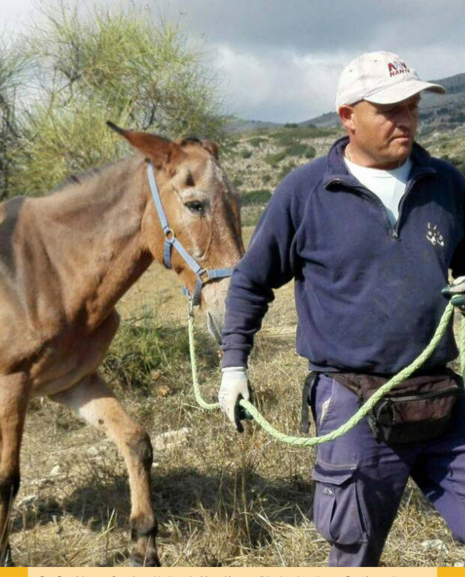
Our Spanish team found an elderly mule, Xarqui in a terrible abandoned state. Starving and too weak to survive alone having been dumped on a remote hilltop by his owner, he was rescued to the safety of our sanctuary north of Malaga, El Refugio del Burrito.