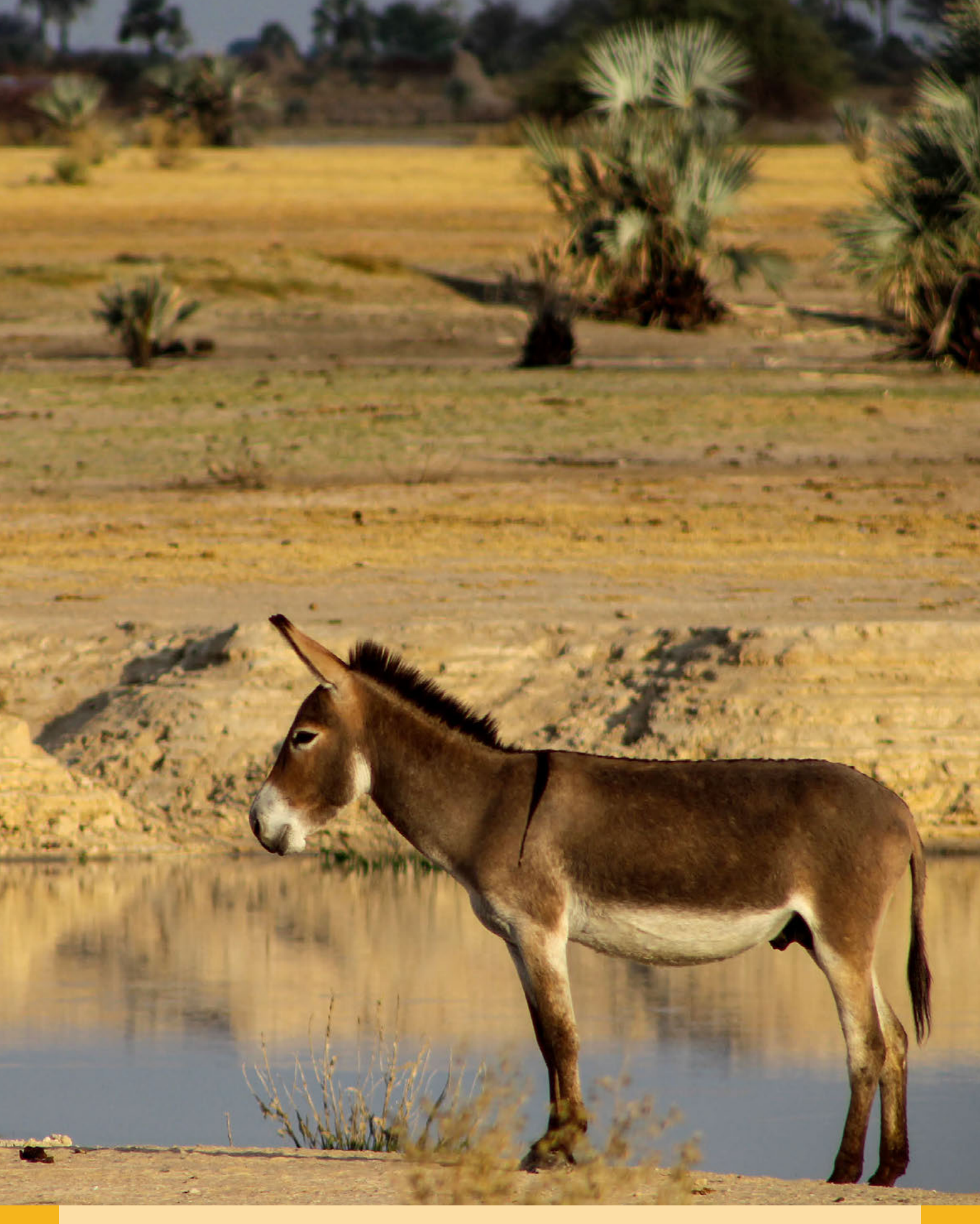
Like all living creatures, whether domesticated or wild, donkeys have the right to a life free from suffering, where their social and intelligent natures can flourish.