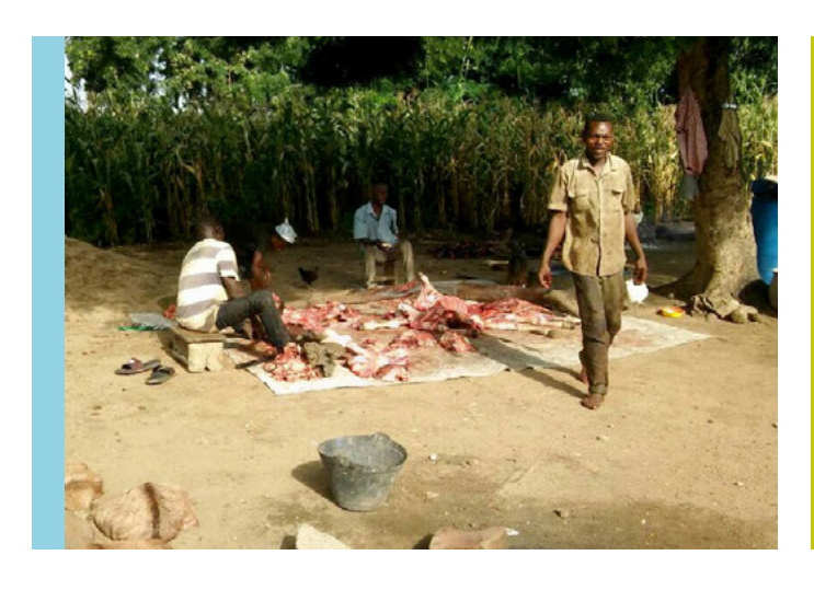
GHANA — case study

Through the Ghana Society for the Protection and Care of animals, we funded a scoping project to unearth the impact that the donkey skin trade is having on population numbers in Ghana. The findings are informing our wider project to tackle the biggest welfare issue facing donkeys today.