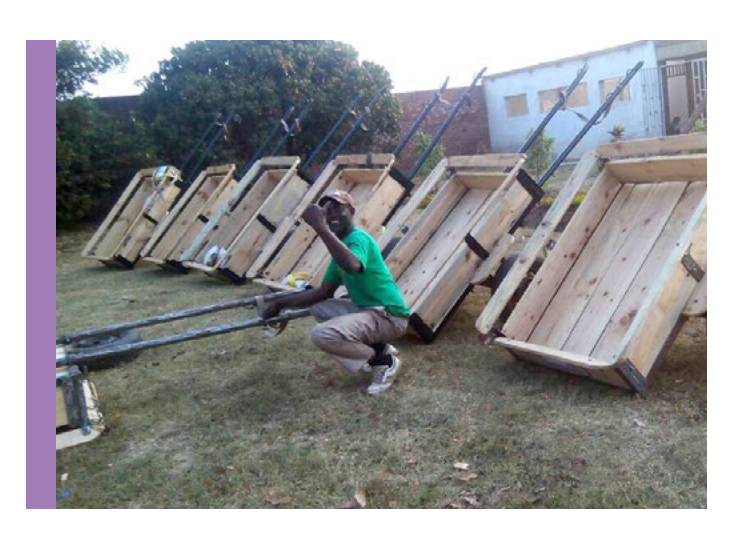
ZIMBABWE — case study

In the brick kilns of Egypt, we continued to support the Egyptian Society for the Protection and Welfare of Working Animals in improving conditions for mules and donkeys by providing veterinary treatment, farriery, and vital education for brick kiln owners and workers.