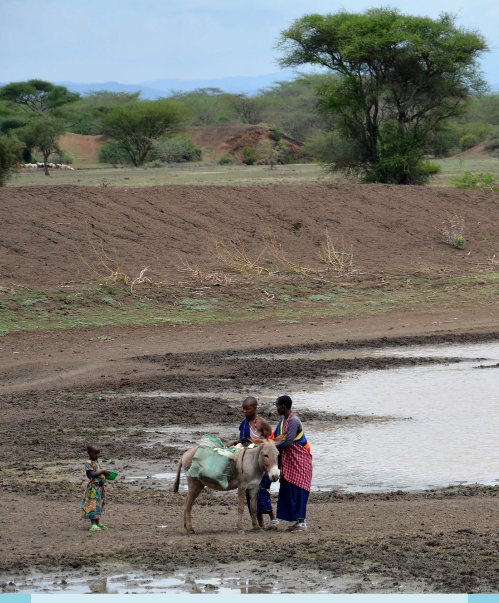
As well as funding our partner Tanzania Animal Welfare Society to distribute food to donkeys affected by the failing rains, we worked with the local Meru Animal Welfare Organisation, funding this partner to conduct community training sessions for welfare-friendly harness design. Local women then became trainers for their communities, to ensure knowledge transfer is sustained.